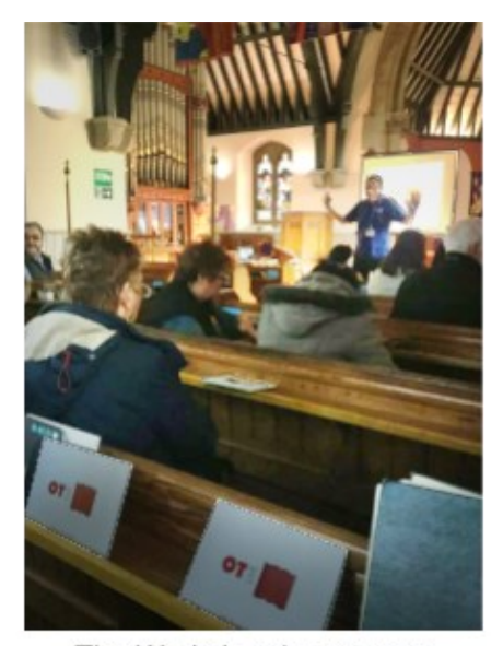
The Workshop in progress

Those attending were advised to bring a packed lunch, and a cushion, given that they were to sit on the pews in church all day. In fact the day was well broken up, with each session lasting about an hour, with comfort breaks in between. St James' put on hot and cold drinks, and two of our young people took the opportunity to provide delicious cakes, for which they asked for donations towards their proposed trip to Finland this summer.