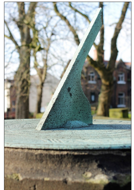
Timepiece at St Giles'