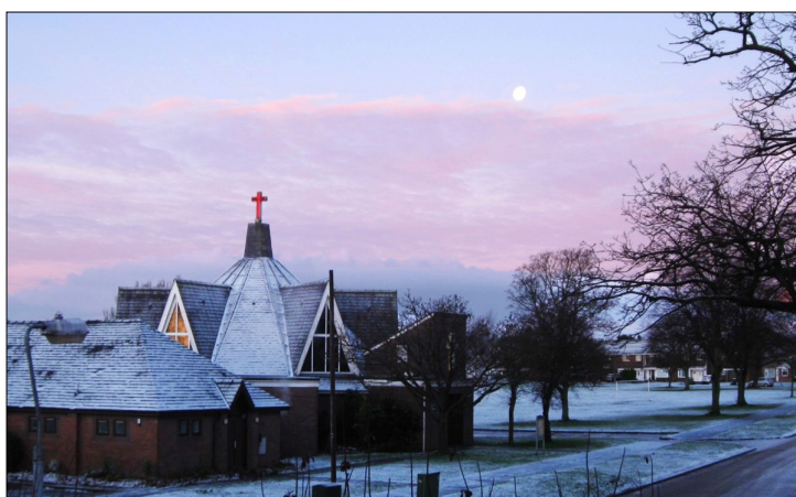
St John's on a cold January morning

We enjoyed having all our Christmas services and events in person this (last!) year, and we hope soon to see some of our members who haven't been back to Church since the beginning of the first lockdown. We also look forward to the time when the builders have finished the work on our toilets, and we can start using our building more fully!