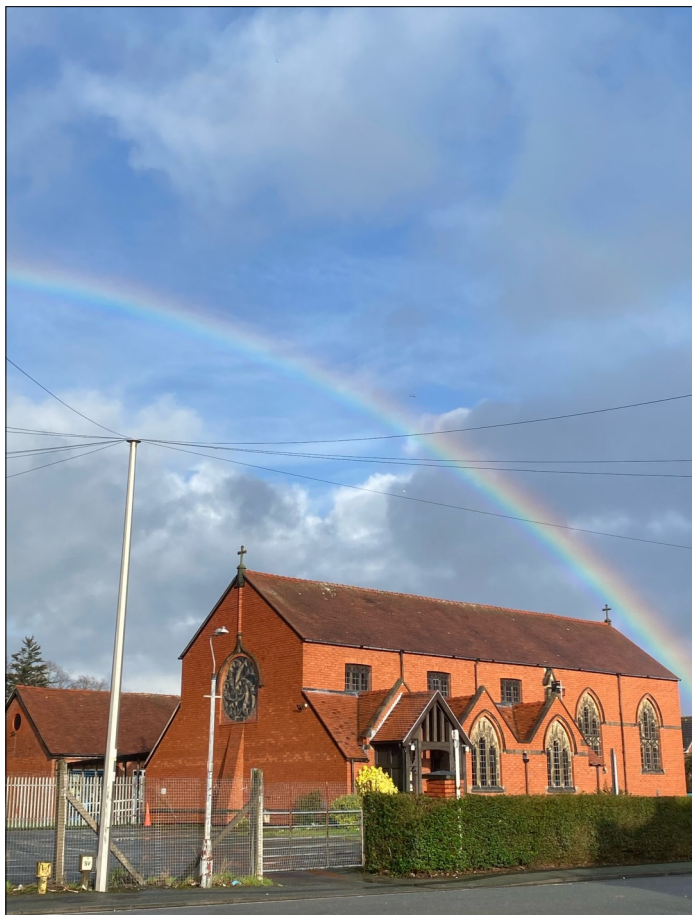
Photo taken by the family of a little one being baptised at All Saints' later this year. They were excited about how the rainbow was over the church- a sign of hope and joy