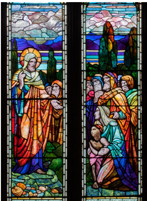
Jesus preaching. Stained glass in St. Giles'

For the Church in Wales, 2022 is the Year of Biblical Literacy, so the St Giles' Lent Course will be focusing on St Luke's Gospel, on how to read it and what it means for us today. There will be five sessions: