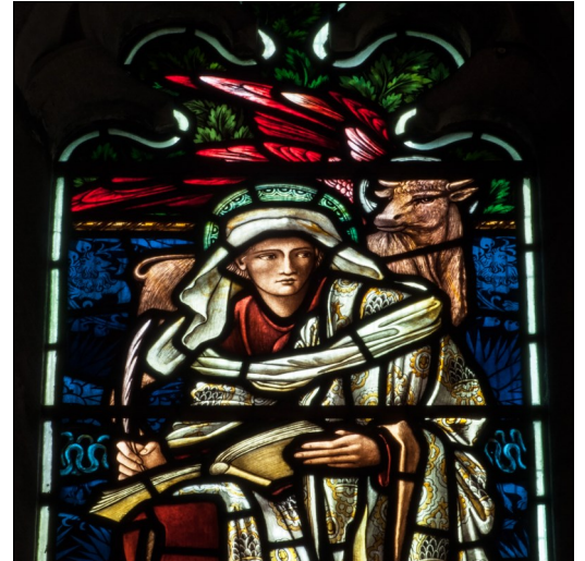
St. Luke, from All Saints' east window

(Please note there will be no Thursday Eucharist at All Saints on 3 March)