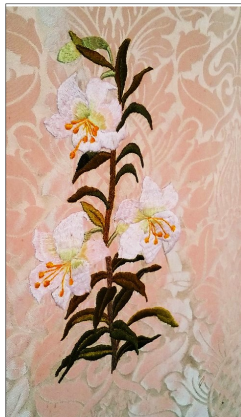
Embroidery detail from the white altar frontal at St Margaret's